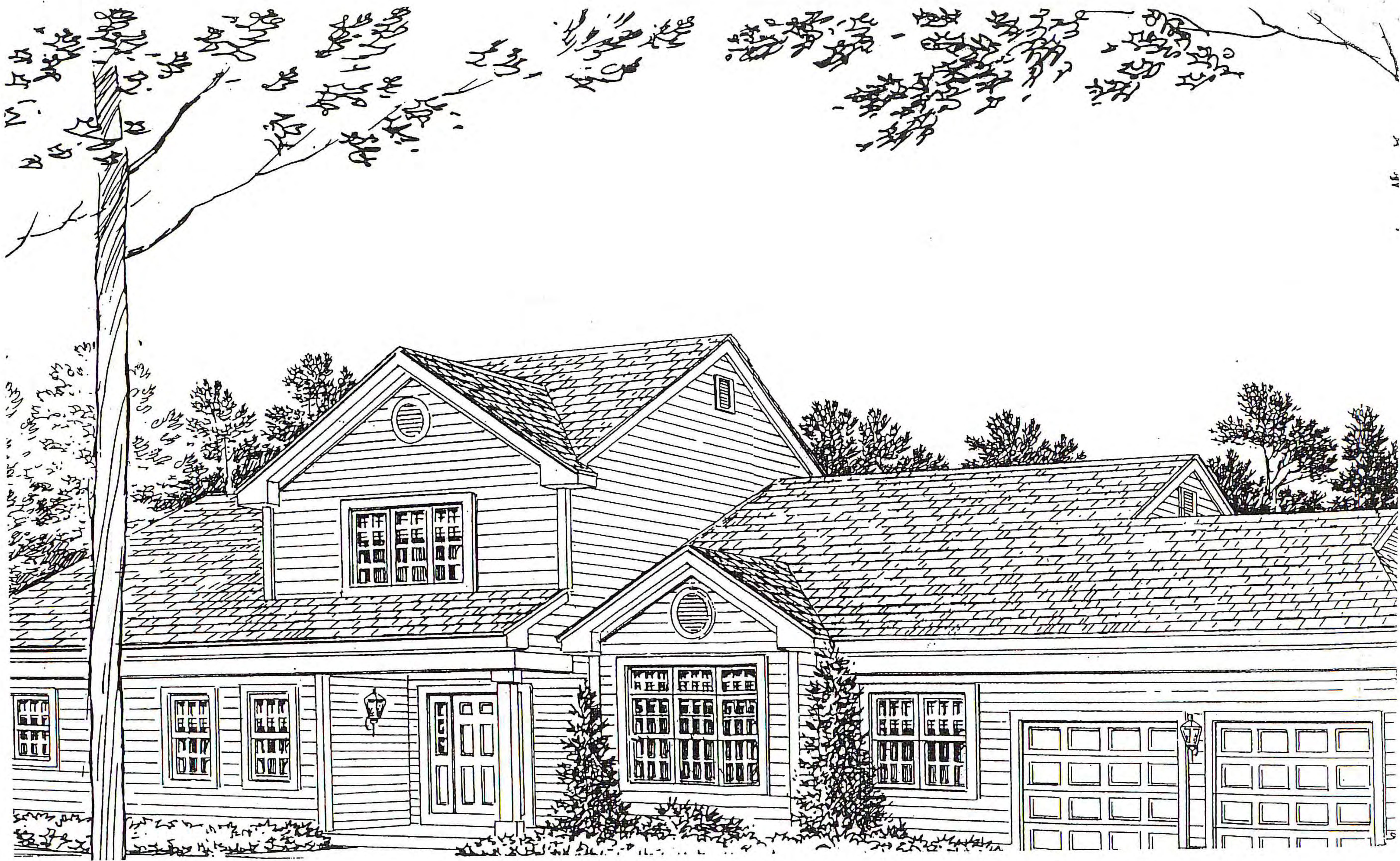
The Franklin Elite